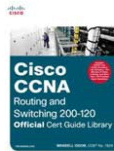
CCNA Routing and Switching 200-120 Official Cert Guide Library