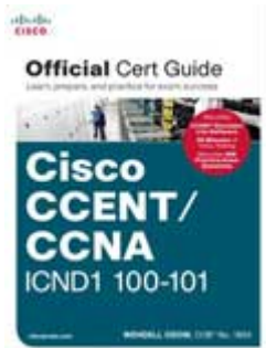
CCENT / CCNA ICND1 100-101 Official Cert Guide