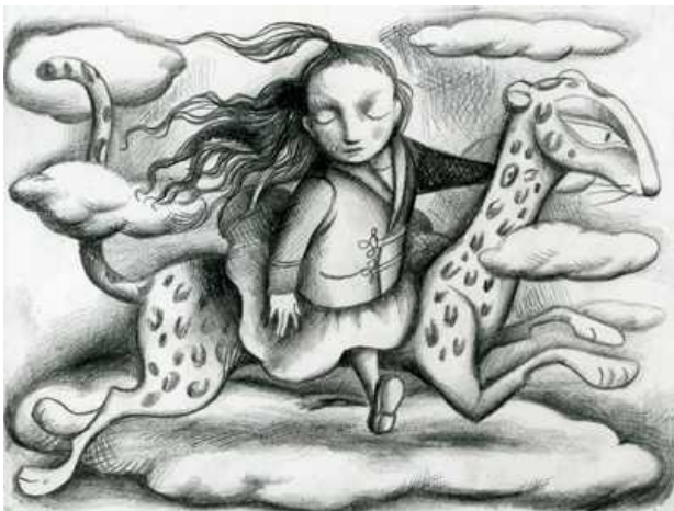
Exeunt on a Leopard