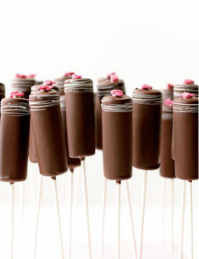
Elderflower Ganache Pops